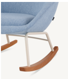
Wooden rocker base