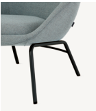
White / black / chrome* steel legs

Always Lounge Chair Rocker w790 d815 h930 seat 430 (mm) weight 22.5 kg w31 d32 h36.5 seat 16.5 (in) weight 49.6 lb