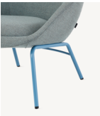
NaughtOne RAL powder coated legs