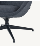
NaughtOne RAL powder coated 4 star base