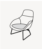
Two-tone See price list for details