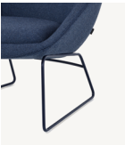
NaughtOne RAL powder coated sled base