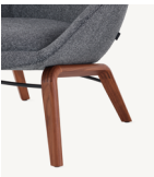
Solid walnut legs