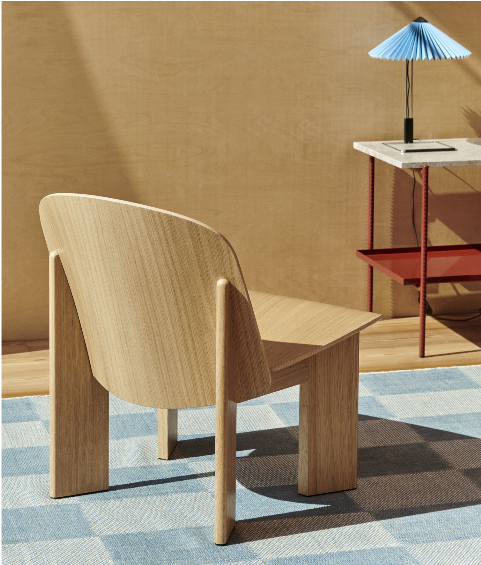
Chisel Lounge Chair | Water-based lacquered oak