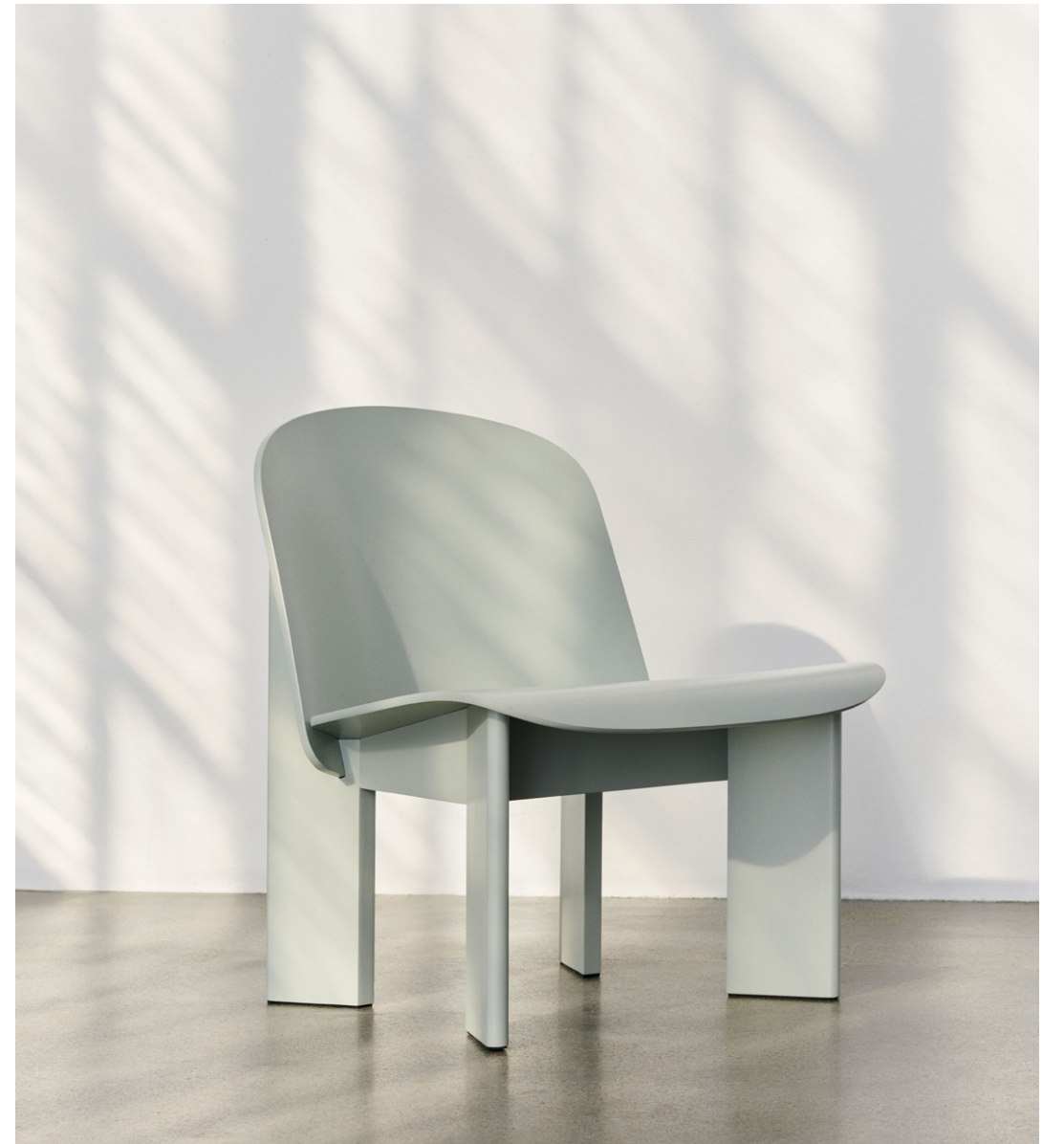
Chisel Lounge Chair | Eucalyptus water-based lacquered beech