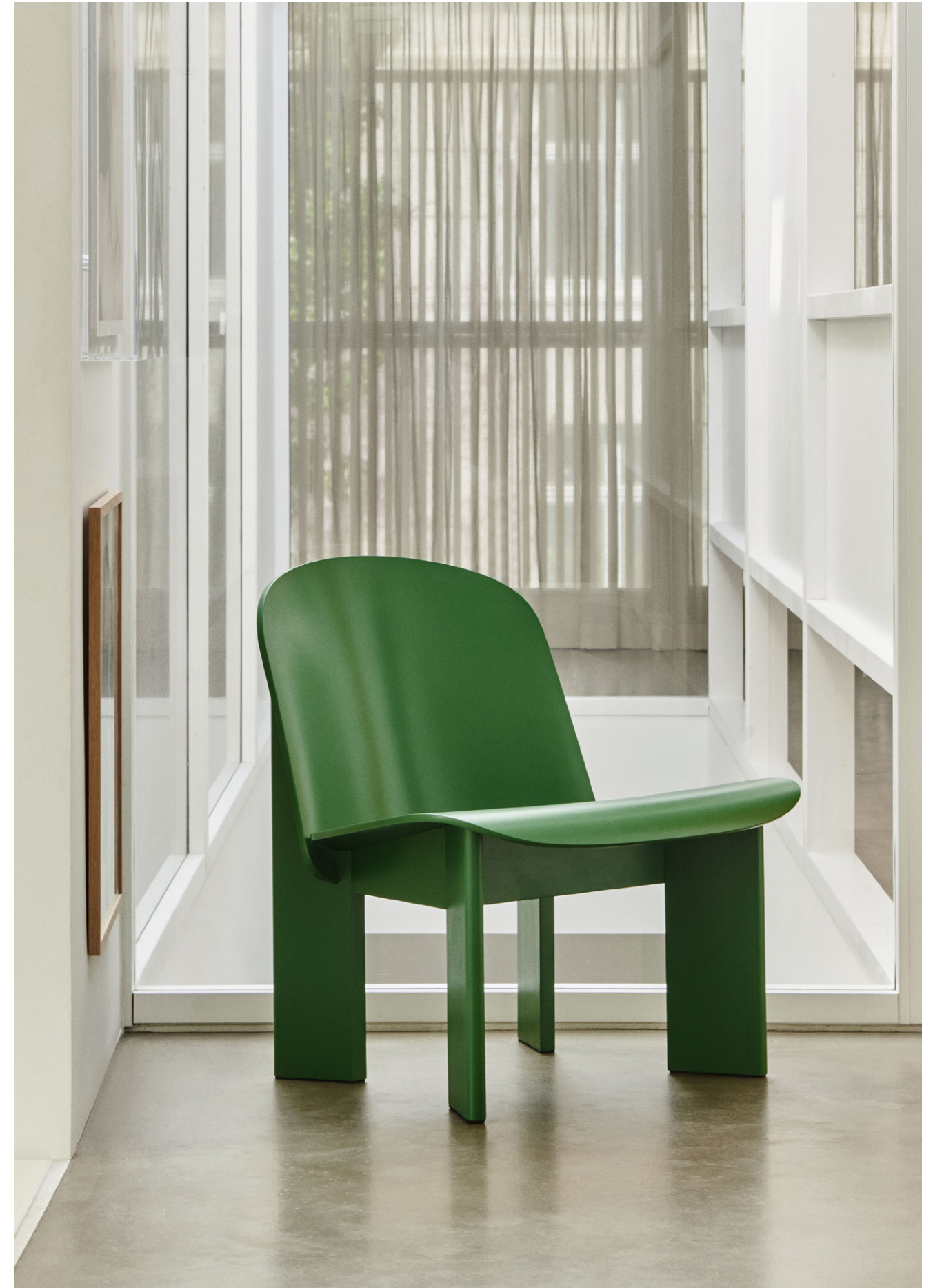
Chisel Lounge Chair | Lush green water-based lacquered beech