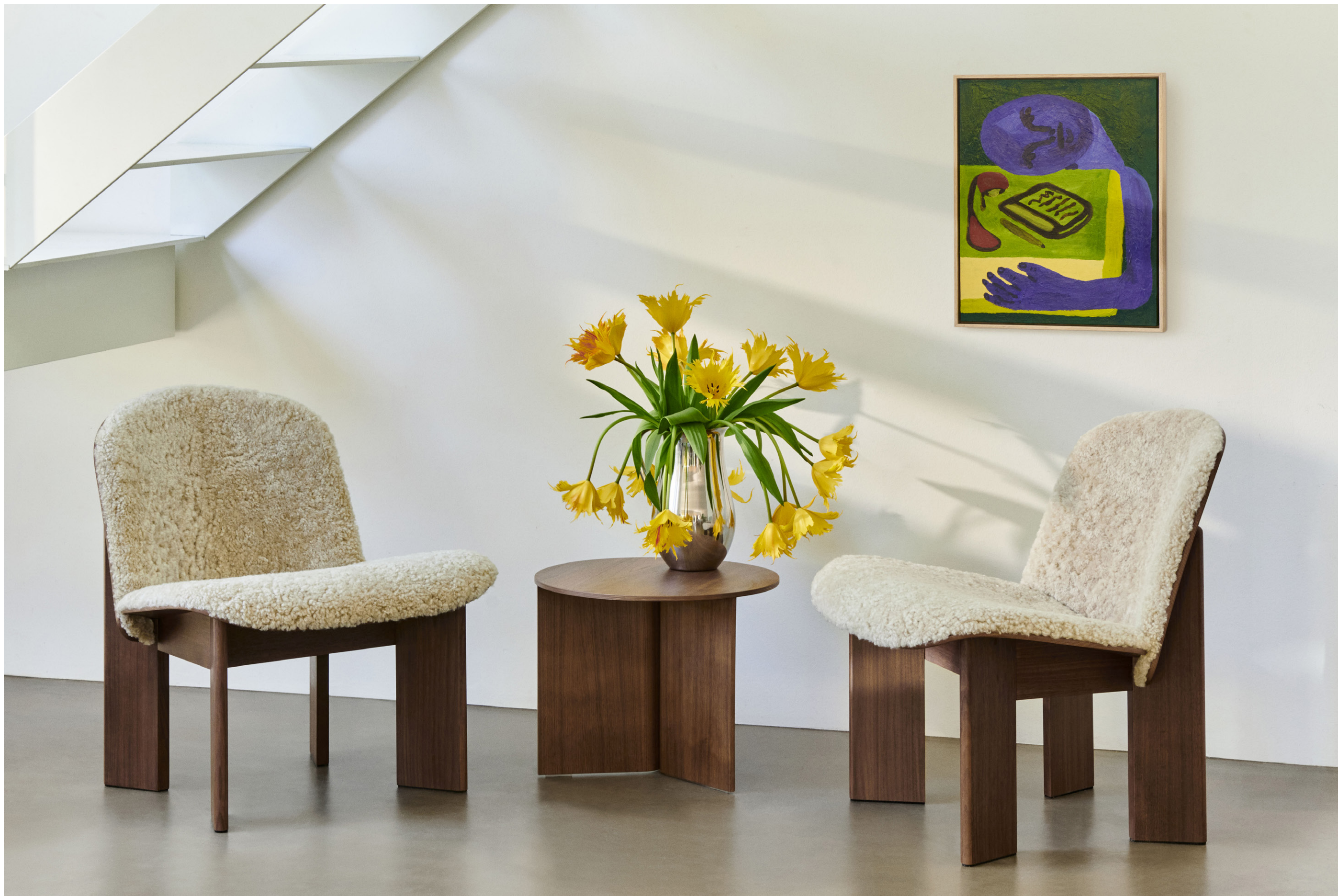
Chisel Lounge Chair | Sheepskin Mohawi 21 | Water-based lacquered walnut