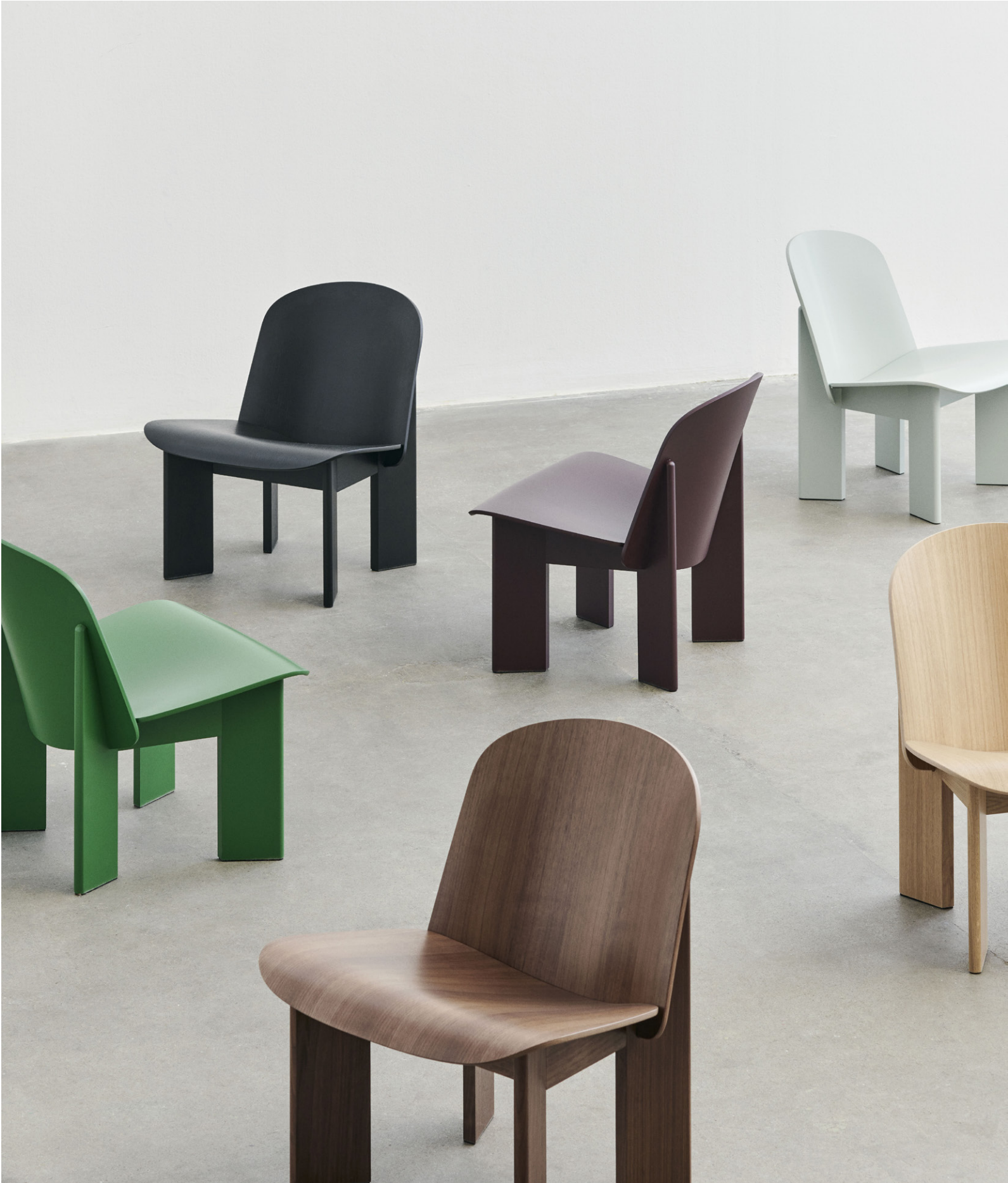
Chisel Lounge Chair Family