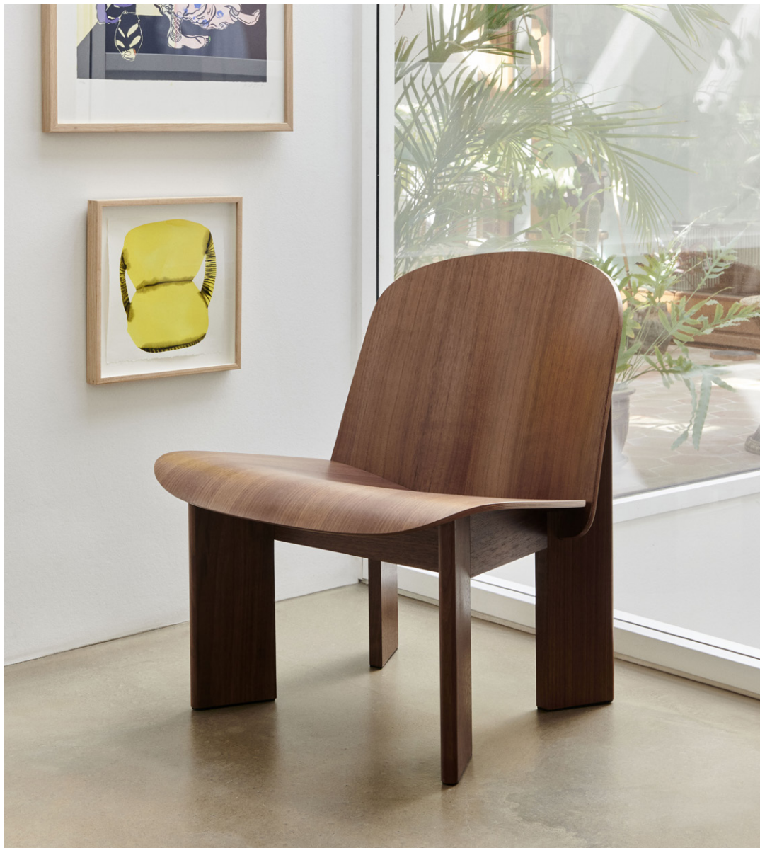
Chisel Lounge Chair | Water-based lacquered walnut