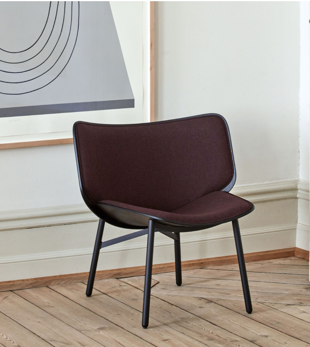
Dapper | Black water-based lacquered oak shell | Uph Olavi by HAY 14 | Black powder coated steel base