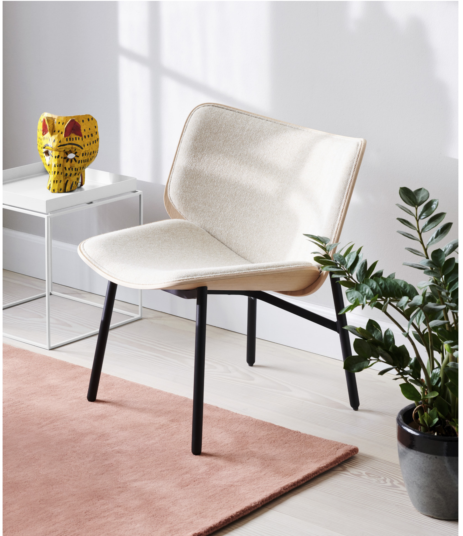
Dapper | Water-based lacquered oak shell | Uph Hallingdal 220 | Black powder coated steel base