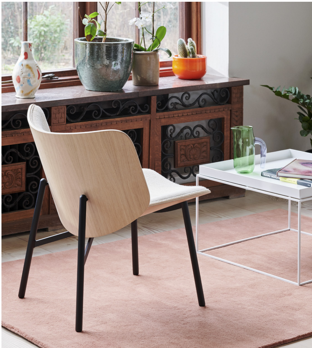
Dapper | Water-based lacquered oak shell | Uph Hallingdal 220 | Black powder coated steel base