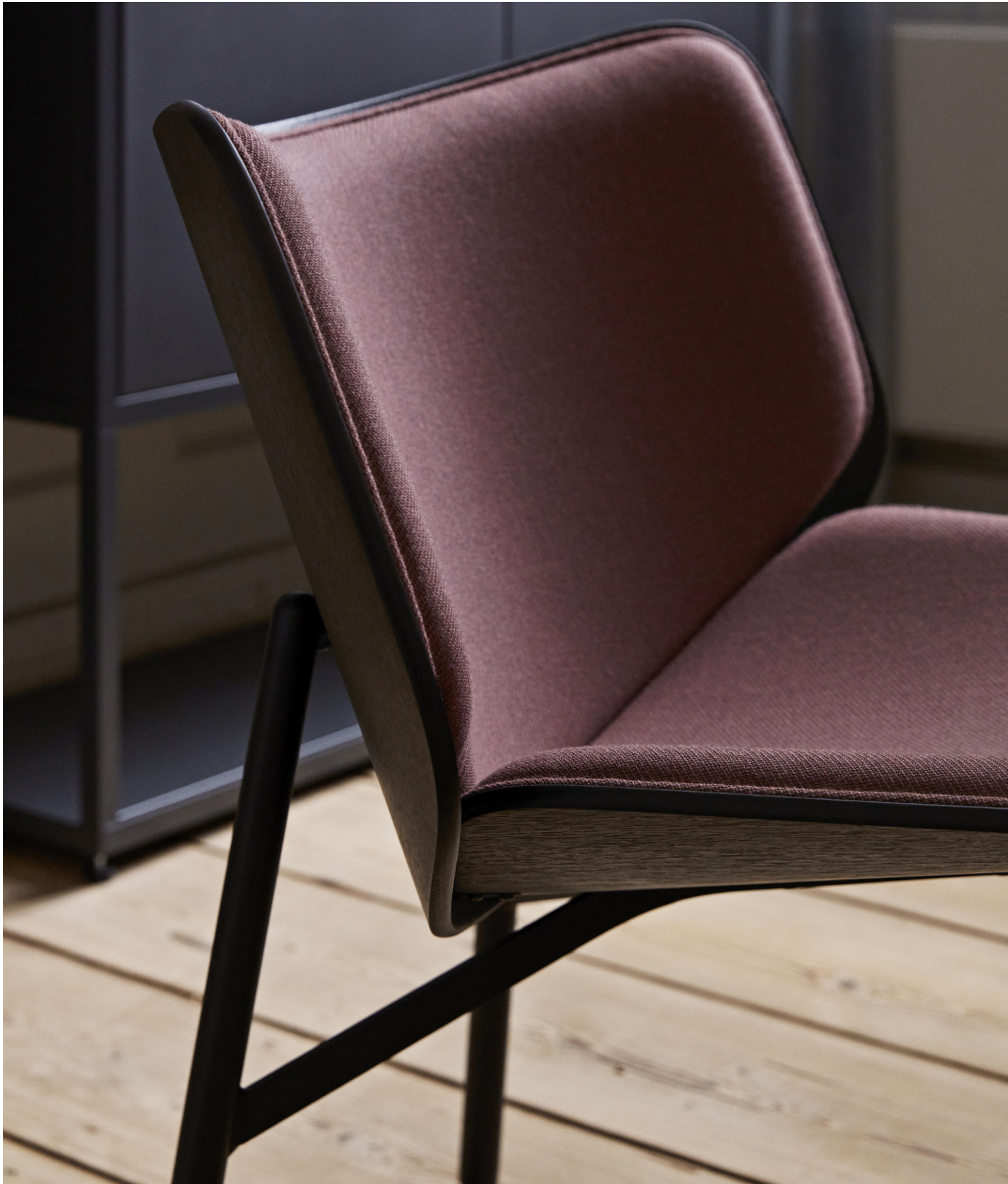
Dapper | Black water-based lacquered oak shell | Uph Olavi by HAY 14 | Black powder coated steel base