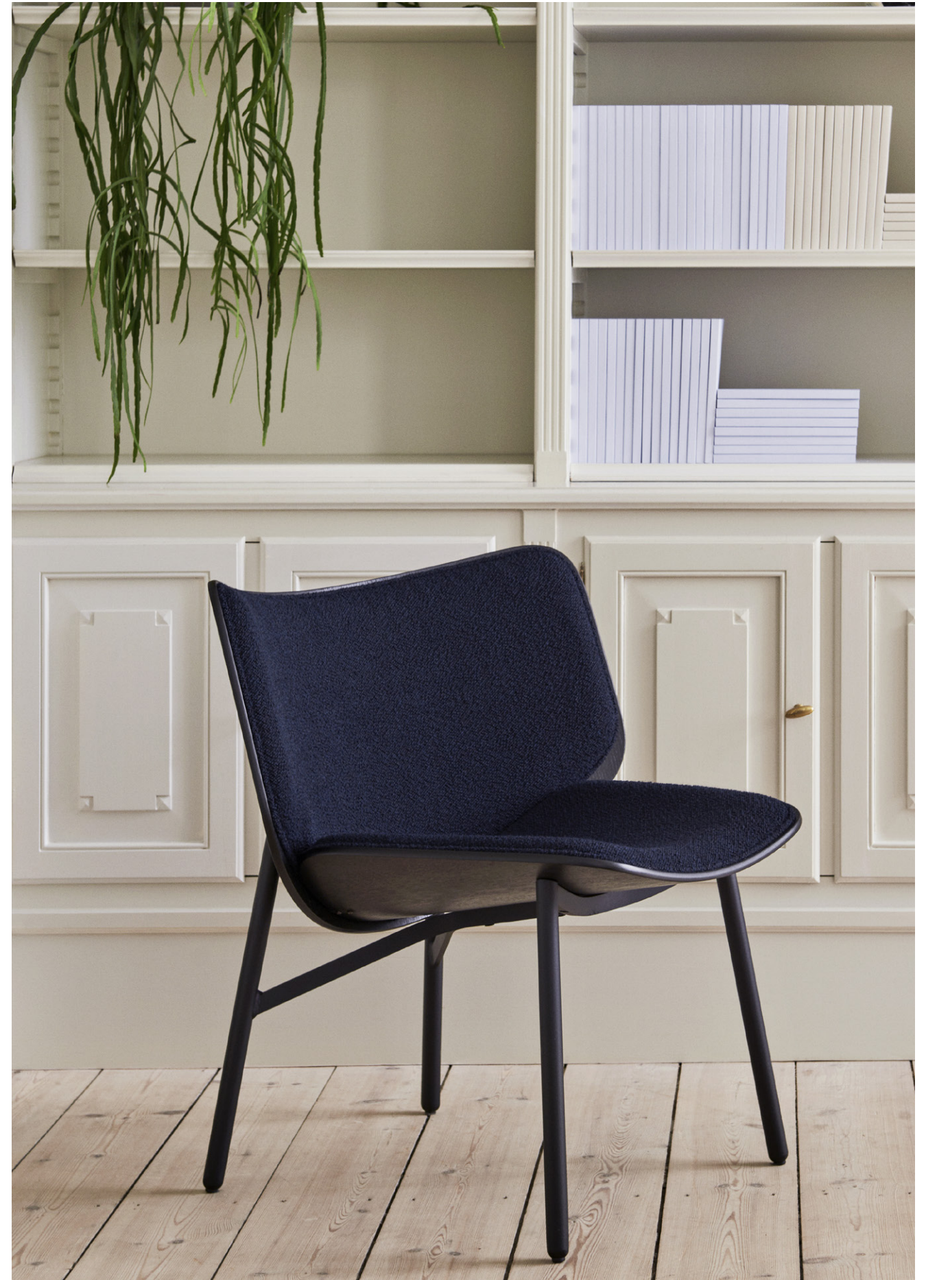
Dapper | Black water-based lacquered oak shell | Uph Flamiber dark blue J4 | Black powder coated steel base