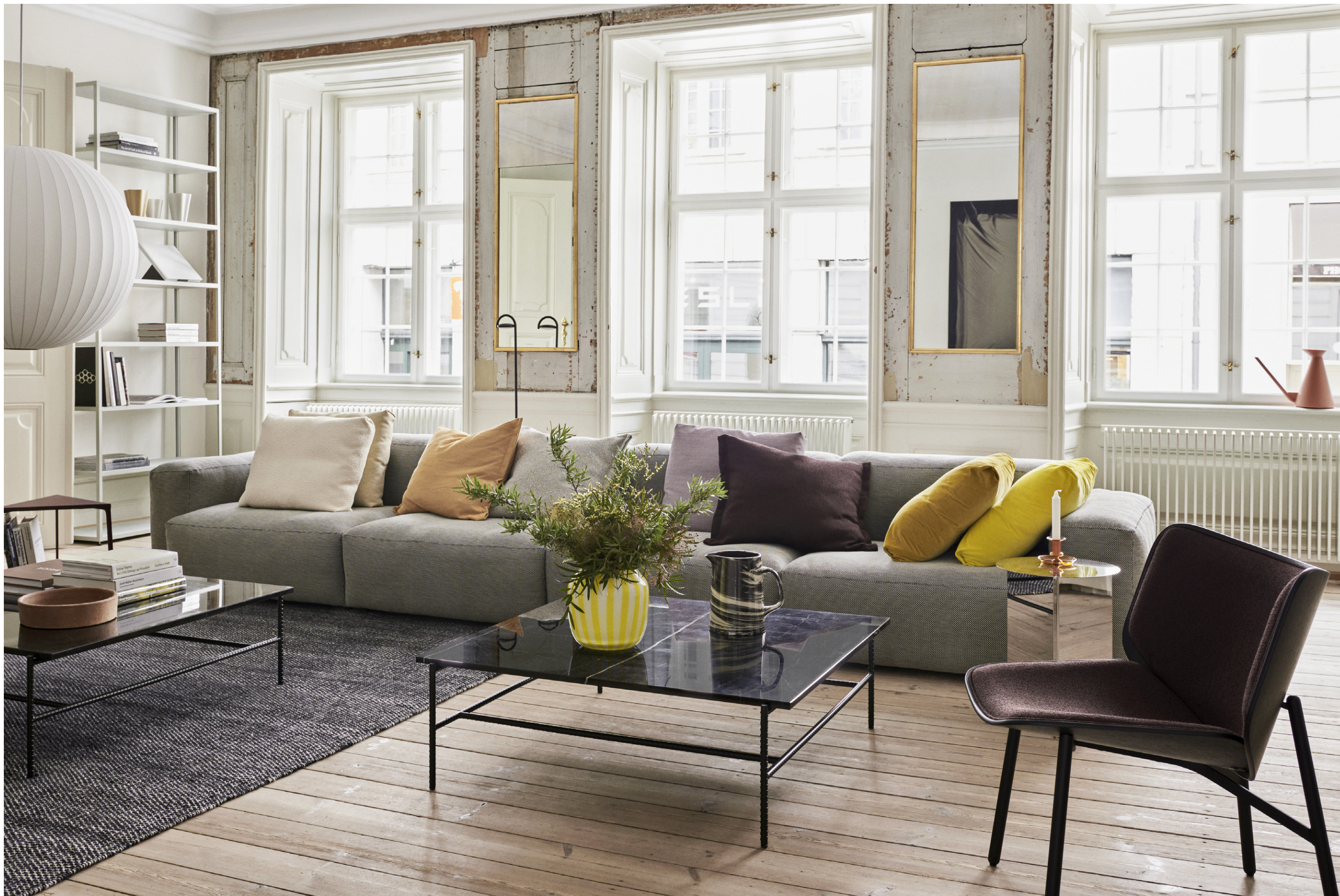
Dapper | Black water-based lacquered oak shell | Uph Olavi by HAY 14 | Black powder coated steel base