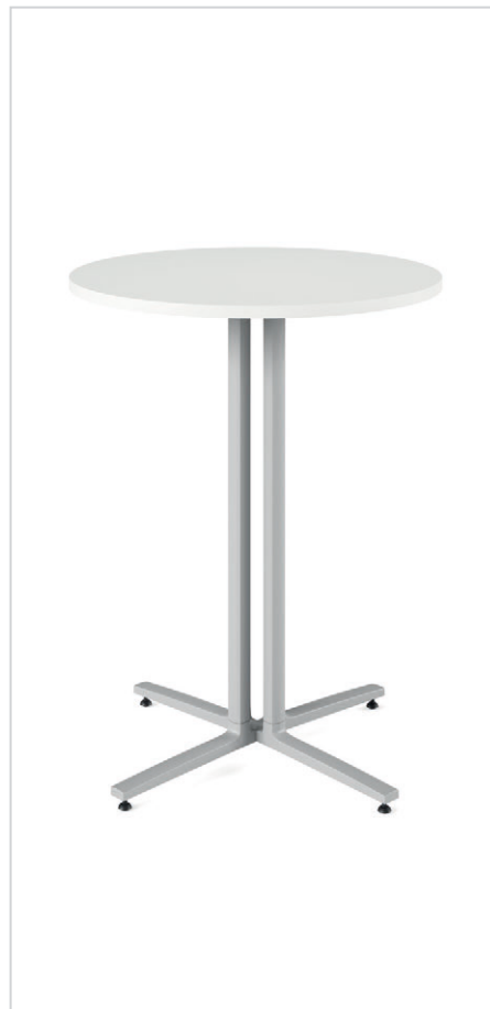
Tables to support collaboration from standing height to conference tables

For full features and options available for Everywhere Tables, please visit hermanmiller.com