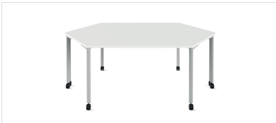
Training tables including trapezoid shapes with castors