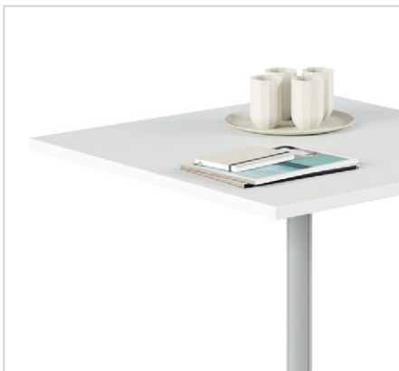
Café and occasional tables