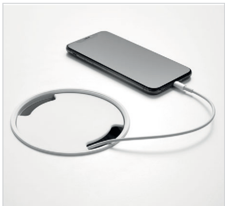
Power and access options