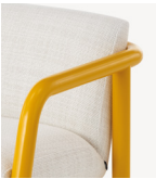
NaughtOne RAL powder coated frame