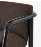
Black / white steel frame